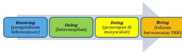
Figure 1: Disaster learning in higher education.

Universities, to implement disaster learning, should compile policies related to disaster risk reduction efforts at tertiary institutions. The disaster learning strategy is intended to increase the knowledge, capacity and skills of students to be able to undertake DRR efforts on campus and in the community [1]. The main strategy in the disaster learning process is basically learning by doing . Based on these considerations, the learning strategy is carried out with conceptual learning at an early stage, then continued with practical learning, and it is hoped that students will have a strong attitude in dealing with disasters. Disaster learning in higher education is shown in Figure 1.